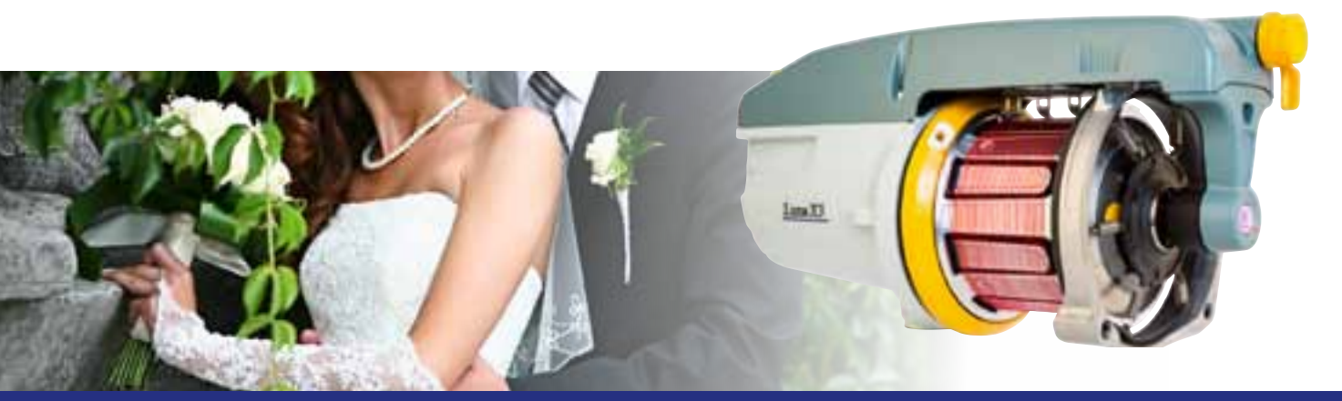
Robustness • Reliability • Quality • Productivity • Versatility